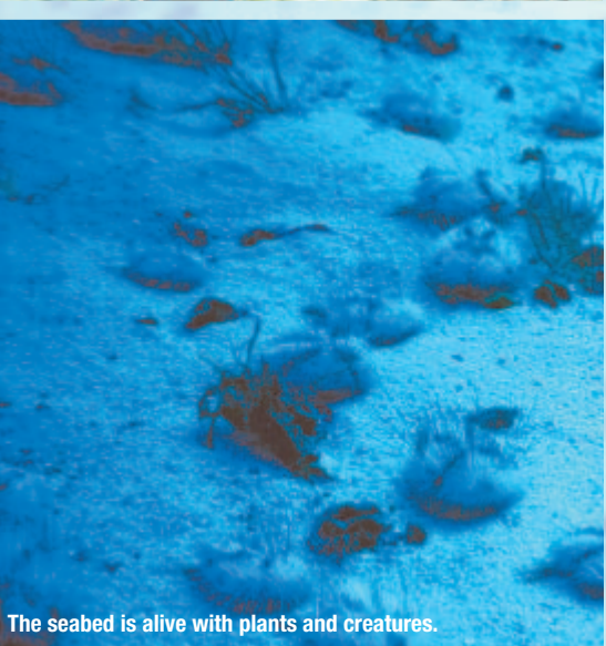
The seabed is alive with plants and creatures.