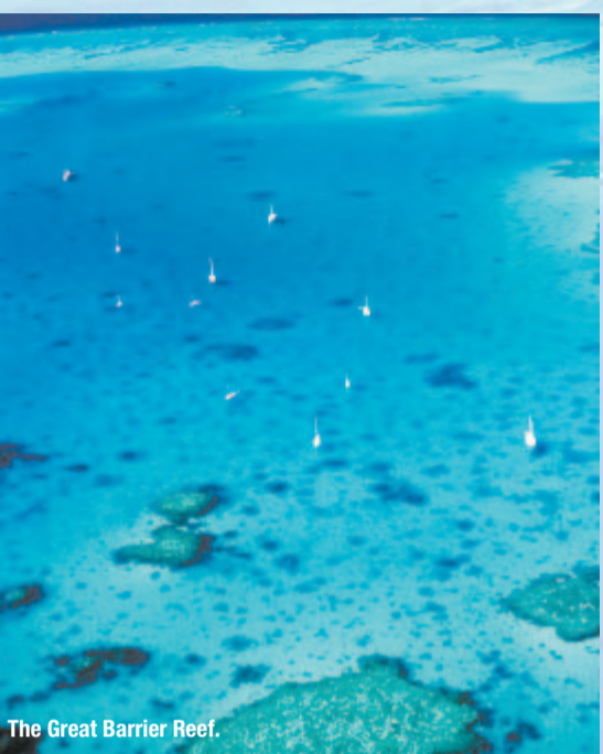
The Great Barrier Reef.