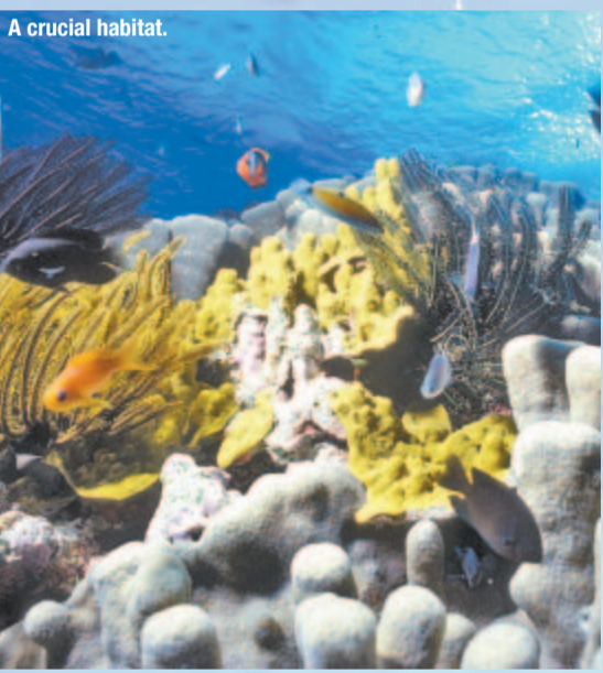
A crucial habitat.